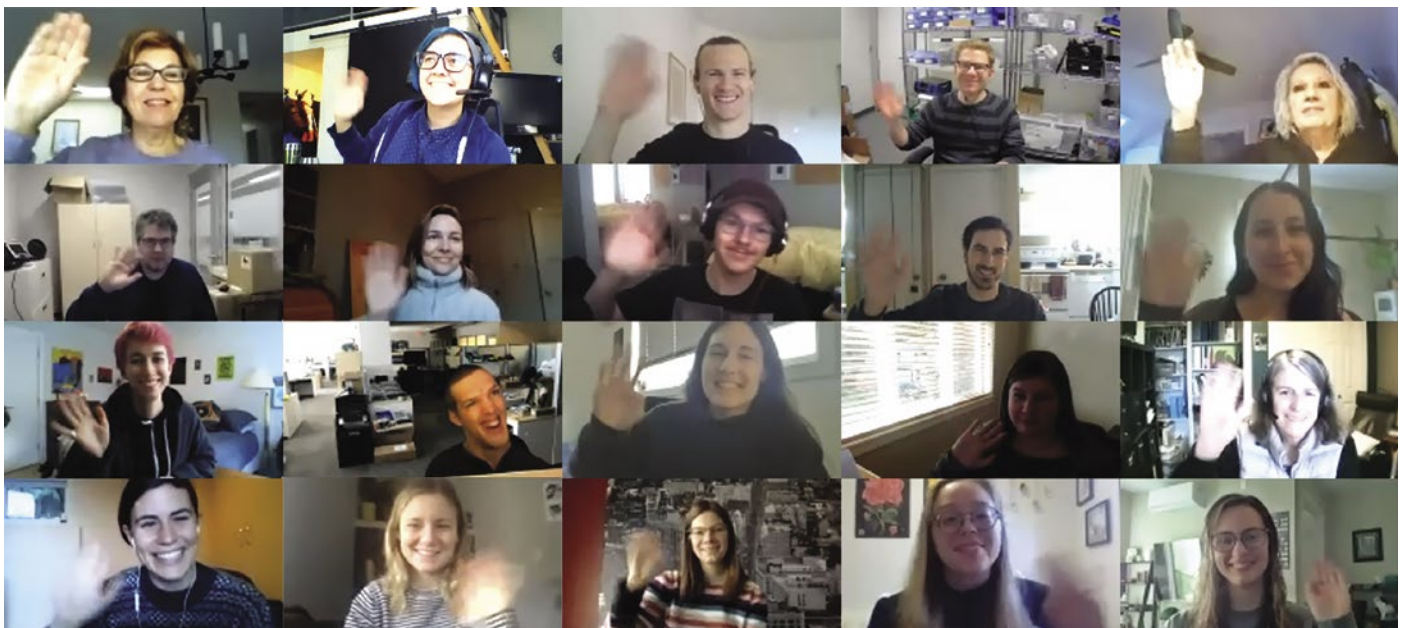
The CanAssist team connecting virtually

CanAssist strives to exceed our funders' expectations and to achieve outcomes that make a difference in the lives of individuals and groups of people who can benefit from similar solutions and strategies. We will continue to make it a priority to engage existing and new funders as we strive to diversify revenue sources in support of our mission as we build momentum and make an impact.